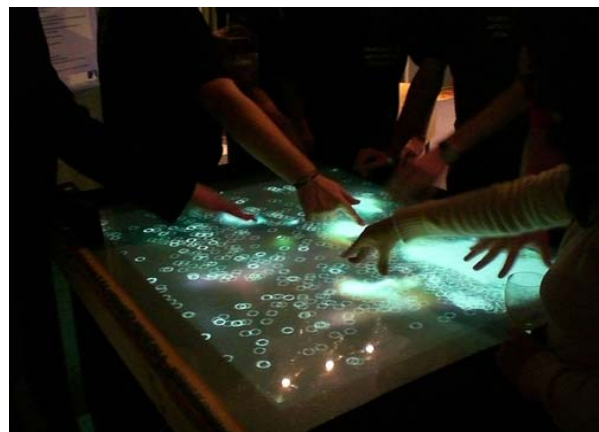
Figure 1: Multi-touch sensitive surfaces are particularly useful for collaboration on large displays such as multi-user tabletops.

Vision-based systems have been proposed to provide higher resolution and support for malleable surface materials. These systems either approximate the 3D position of the user's hand through pixel intensity [6], stereoscopy [5][13], or through markers attached to a deformable material [3][10][11]. Using a deformable material has the added advantage of providing passive