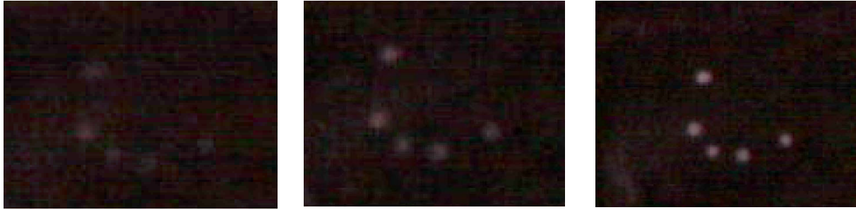
Figure 2: The pixel intensity grows as touch pressure grows. The left image is a zero-force touch, center is a light press, and right is a hard press.

haptic feedback and adds an element of depth to the interaction surface. Additionally, these surfaces typically report pressure as a vector, meaning touch pressure can be interpreted in directions not necessarily perpendicular to the interaction surface. However the markers on the deformable material must be opaque, meaning the system must be top-projected.