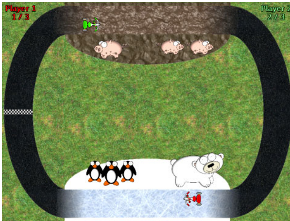
Fig. 3. The Pedal Race game. Player 1 (red trike) has completed 1 lap and is moving across the ice; Player 2 (green trike) has completed 2 laps and is in the mud.

Physical feedback has been shown to influence presence in virtual environments [24]. A lack of haptic feedback can decrease presence and task performance in collaborative groupware [25]. It has been proposed that force-feedback is important in exergames to simulate real-world activity. As we have discussed, several exergames do provide physical feedback to actions occurring on-screen. However, to our knowledge, the effect of haptic feedback on presence in exergames has not been experimentally investigated. Currently, it is unclear if the benefits of haptics in desktop environments [25] are transferable to exergames. To help fill this gap, we have created the Pedal Race exergame. In this game, haptic feedback is used to enhance the experience of riding over different types of virtual terrain.