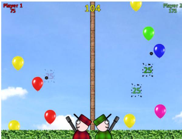
Fig. 2. The Balloon Burst game. Player 1 (red) has shot a balloon for 25 points; Player 2 (green) has just shot two balloons for 50 points; 104 seconds remain in the game.

Haptic cues integrated into exercise equipment have been found to be effective at signaling people to adjust exercise intensity [10]. The use of haptic cues in exergames to guide players to effective levels of exercise has not been explored. In order to illustrate this approach, we created the Balloon Burst exergame, described below.